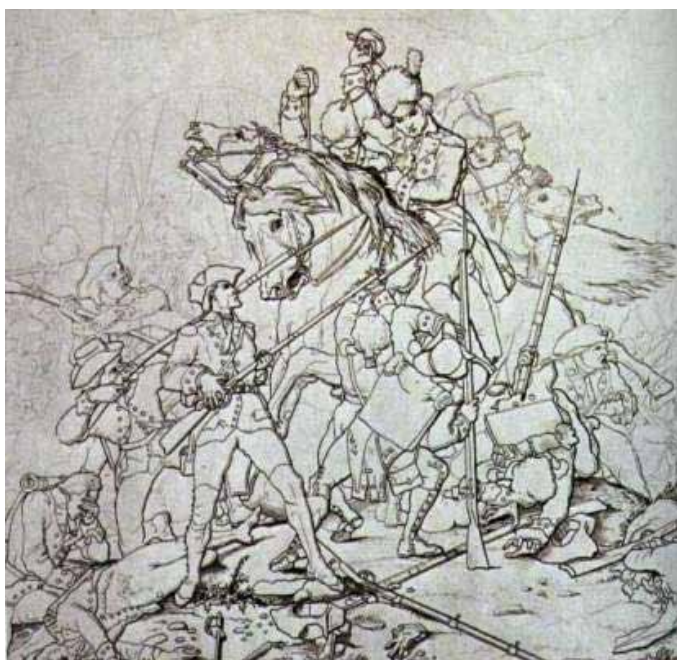
Sketch of the Waxhaw Massacre thought to be for a 19th century lithograph