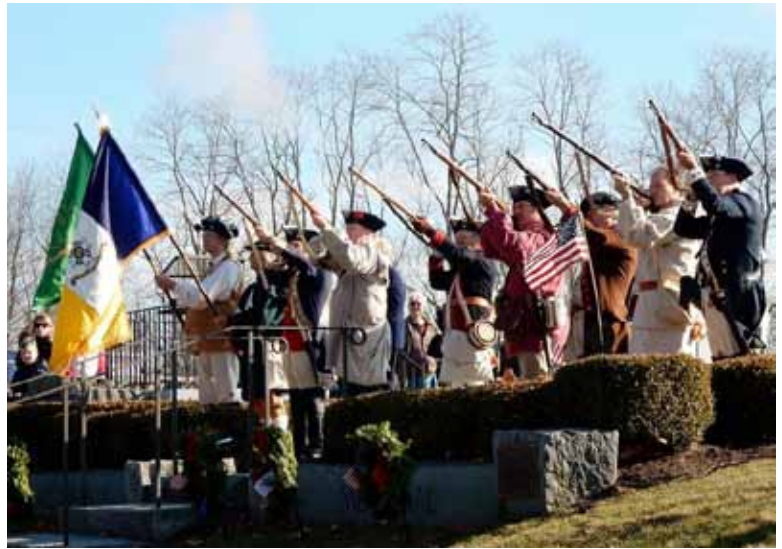
Ten SAR Color Guard members participated in the event, and seven more non-Color Guard members of the Gov. Oliver Wolcott, Sr. Branch #10 SAR were in attendance.

Wreaths Across America ceremonies begin promptly at 12:00 NOON and they take place simultaneously all across the Country.