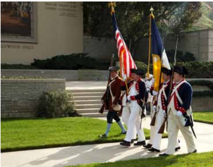
Orange County Chapter Lee's Legion Color Guard