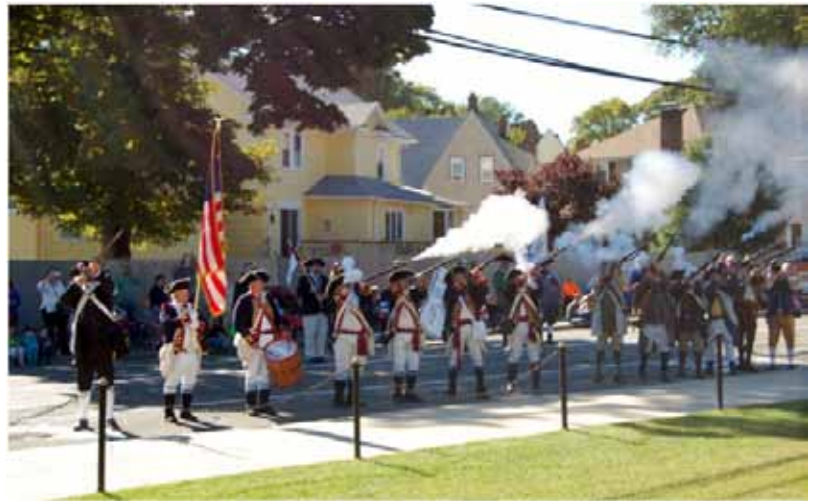
Medford, MA 385th Anniversary Parade

Boston takes you to places where history was made! Walk along the iconic Freedom Trail with its nationally significant historic sites and authentic treasures. Visit a unique collection of museums, churches, meeting houses, burying grounds, parks, a ship, and historic markers that tell the story of the American Revolution and beyond. Learn about the brave people who shaped our nation. Discover our rich history as it began in Massachusetts, where every step tells a story.