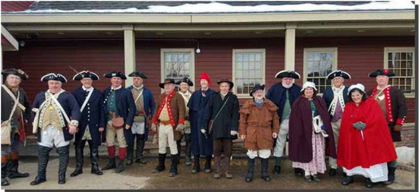
Fifteen compatriots and wives gather in front of J. Timothy's for their annual group photo after their luncheon meeting at the historic, 18th-century restaurant. The Color Guard calendar for 2016 was approved by the members of the Connecticut Line, along with the awarding of Color Guard medals and the election of officers.