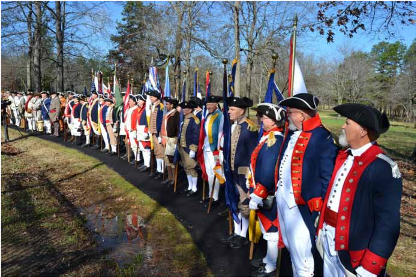
Color Guard in file at the Washington Light Infantry Monument at the approximate location of the 2nd line of battle.