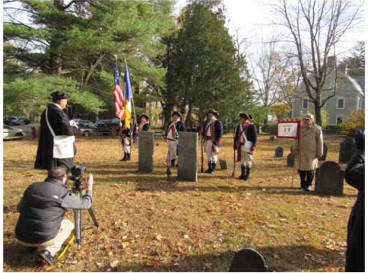
Celebration of the Yorktown Victory -- Deerfield Village, Deerfield, MA