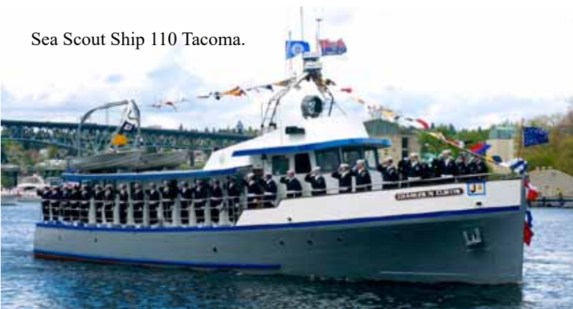
Sea Scout Ship 110 Tacoma.

[Our SAR Medal is seen hanging around her neck by a ribbon. The ship's wheel & royal blue ribbon is her Quartermaster Rank]