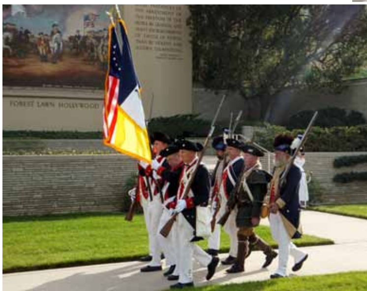
Riverside & Redlands Chapters combined Color Guard