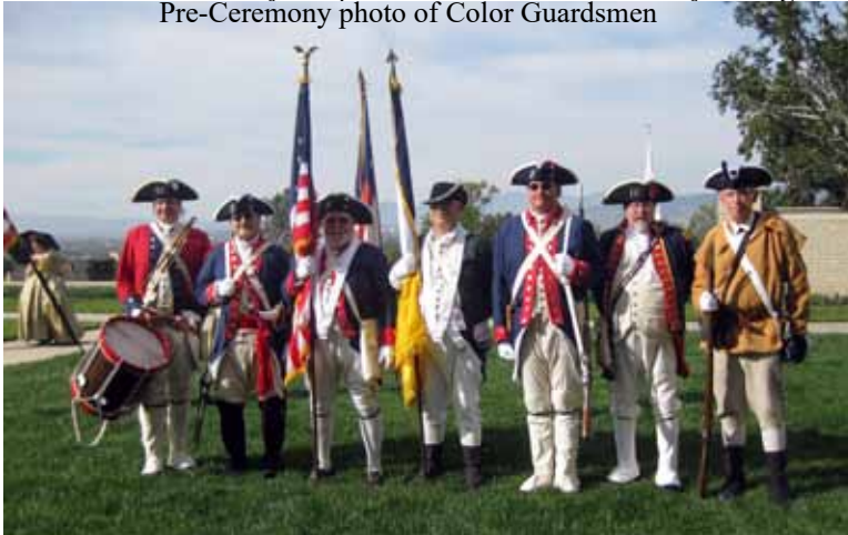
Pre-Ceremony photo of Color Guardsmen