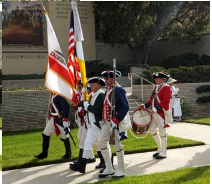
Kern Chapter Color Guard