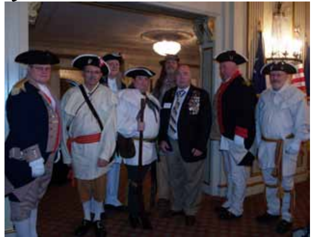
Friday evening banquet color guard.