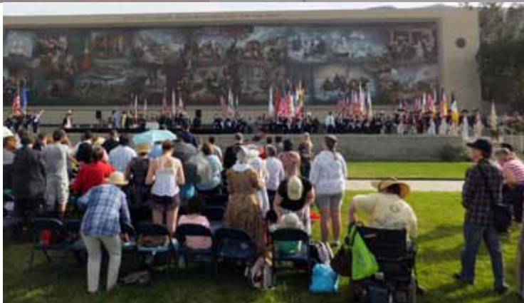
Color guard comprised of compatriots from San Diego, General George Patton and Eagle Chapters.

Also in attendance were about one dozen additional compatriots and members of the California Ladies Auxiliary.