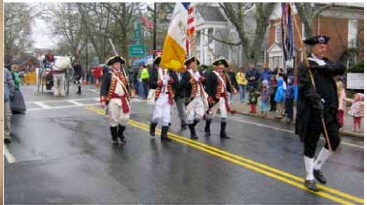
Patriots' Day - - The 240 Anniversary of the Battles of Lexington and Concord.