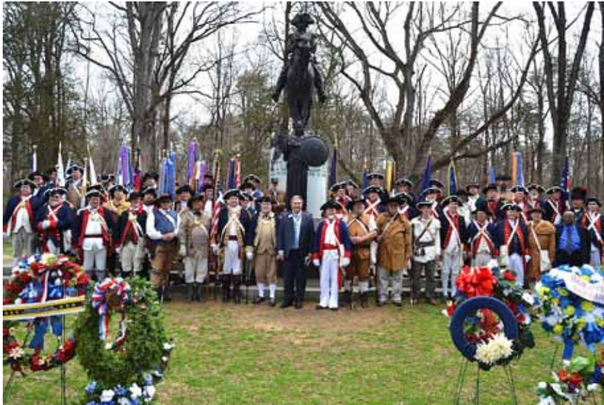
Color Guard at Guilford Courthouse Celebration.