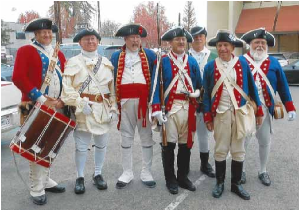
From the California Society - Kern County Chapter Color Guard. At the Granite Point Elementary School, Bakersfield, CA.