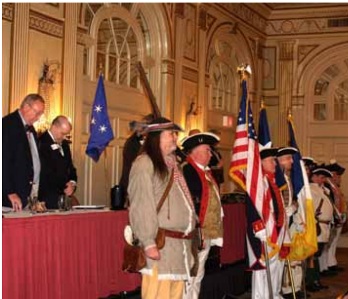
Regardless the confusion about wearing or not wearing uniforms Commander Hoover formed a color guard for the Friday evening banquet.