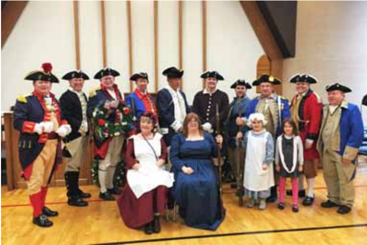
SAR & DAR Color Guard: