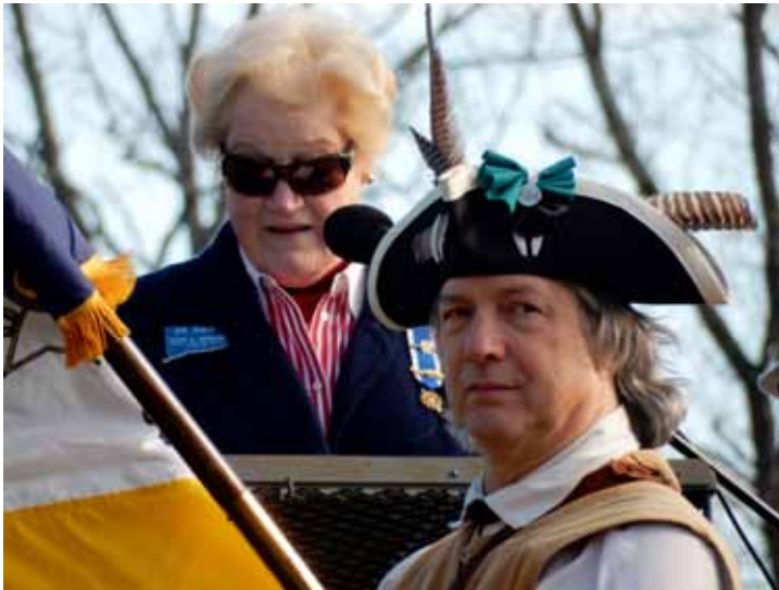
The Mary Floyd Tallmadge Chapter of the Daughters of the American Revolution sponsored and conducted the event.

Seven specially designated wreaths were placed for the Army, Navy, Marines, Air Force, Coast Guard, Merchant Marine, and POW/MIA. The wreaths serve to: remember all soldiers, sailors, airmen, and marines who served; honor their sacrifices; and teach our younger generations about the high cost of our freedoms.