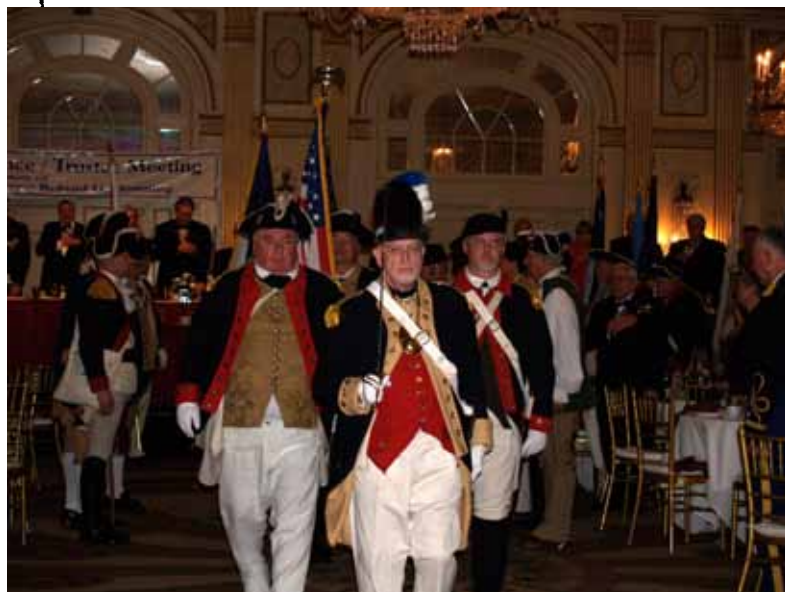
Color Guard retiring the Colors at the Saturday Banquet.