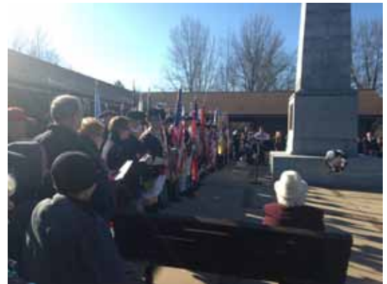
The NSSAR Color Guard at the National Monument

Prior to the placement of the NSSAR wreath by President General Brock, the NSSAR Color Guard formed an arch around the rear of the monument. After the wreath presentation, the Color Guard posed for pictures.